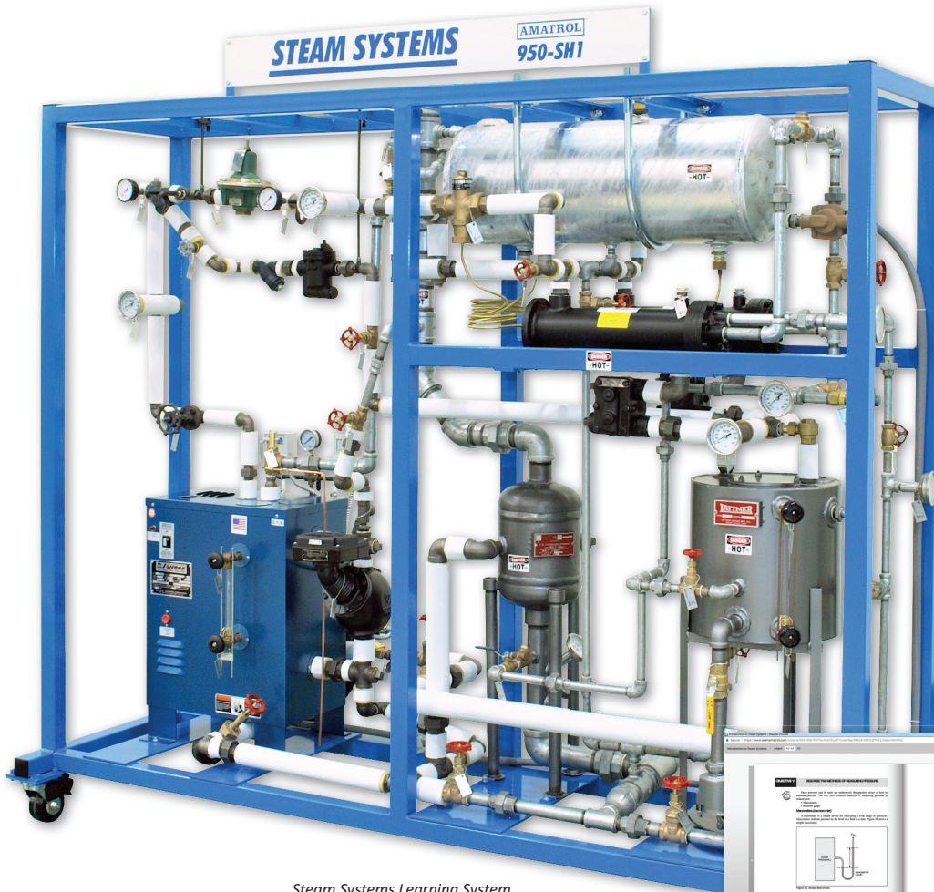
Steam Systems Learning System