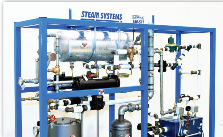
950-SH1 Learning System

The 950-SH1 features an electric boiler that is an ASME coded pressure vessel rated at 100 psig that can attain 36 psig steam pressure and 36 lbs./hr flow rate. The boiler also features low water cutoff/level control, steam pressure gauge, and both automatic and manual reset operating controls. The 950-SH1's condensate feedwater system features a 9 gallon condensate tank, turbine type condensate pump, and a 0.5 Hp electric motor. The learning system also features several valves, including: pressure regulator, safety relief, temperature regulator, 2-way, check, and globe.