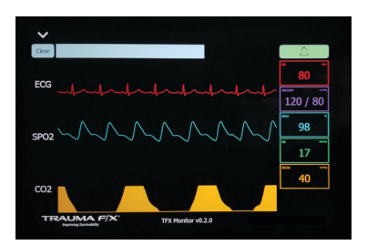
Optional Vital Signs Monitor